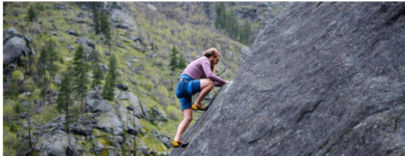
I like rock climbing because it is dangerous

EXERCISE 07: Go through all the adjectives above and look up any words you don't know in a dictionary.